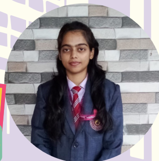
Head of Documentation