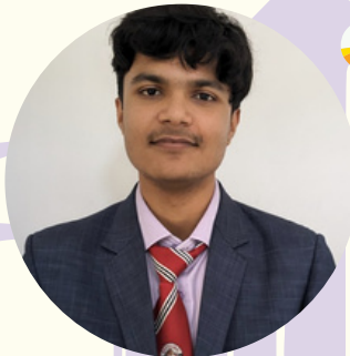
Head of Delegate Affairs